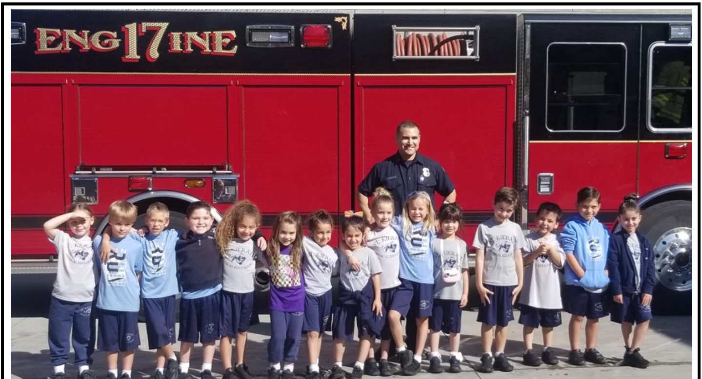
Kindergarten visits the ALPINE FIRE DEPARTMENT!