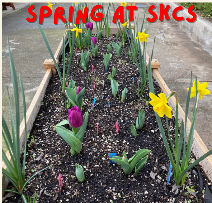
Gr. 1 & 2's garden!