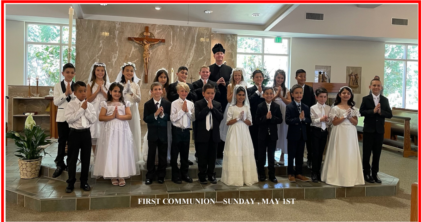
FIRST COMMUNION—SUNDAY, MAY 1ST

The Staff arrived on Monday morning to a refrigerator overflowing with yogurt, fruit, drinks, cheese and crackers, and a table full of bagels & cream cheese, pastry and flowers. Enough goodies to last us until the summer. What an amazing Surprise. We thank you with all our hearts— so thoughtful!